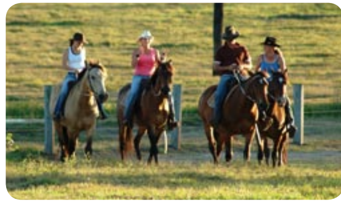
Picture: Susan River homestead