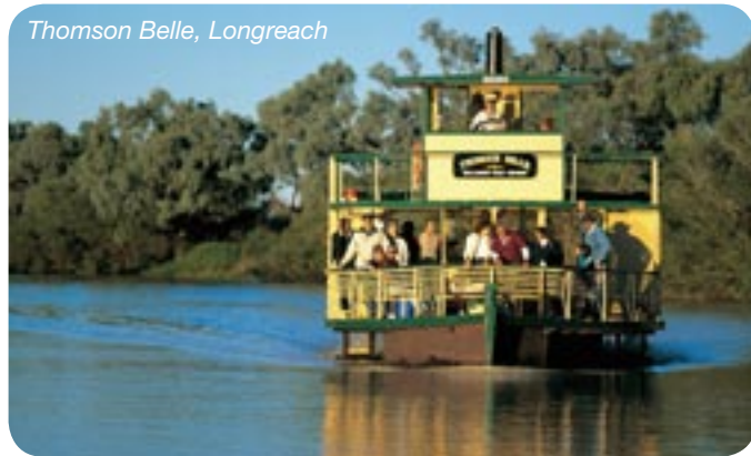
Thomson Belle, Longreach