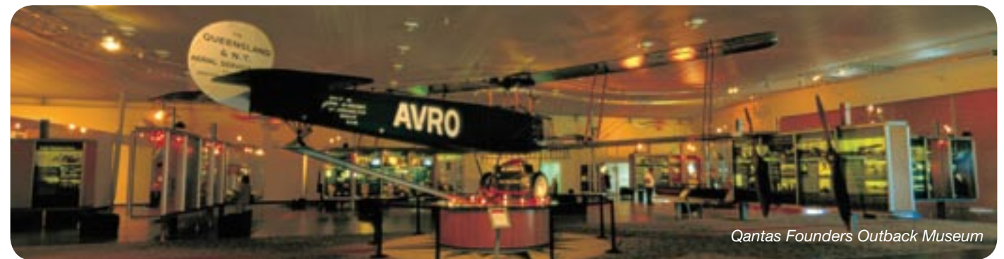
Qantas Founders Outback Museum

Be amazed by the achievements of legendary characters while interacting with the exhibits at the Australian Stockman's Hall Of