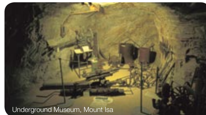
Underground Museum, Mount Isa

The Hard Times Mine is a unique underground experience in a mine built and operated by real miners that provides a rare opportunity to get up close and experience first hand the daily life and workings of an underground mine. From the moment you kit-out in your safety gear and descend in to the mine, to the moment you feel the earth