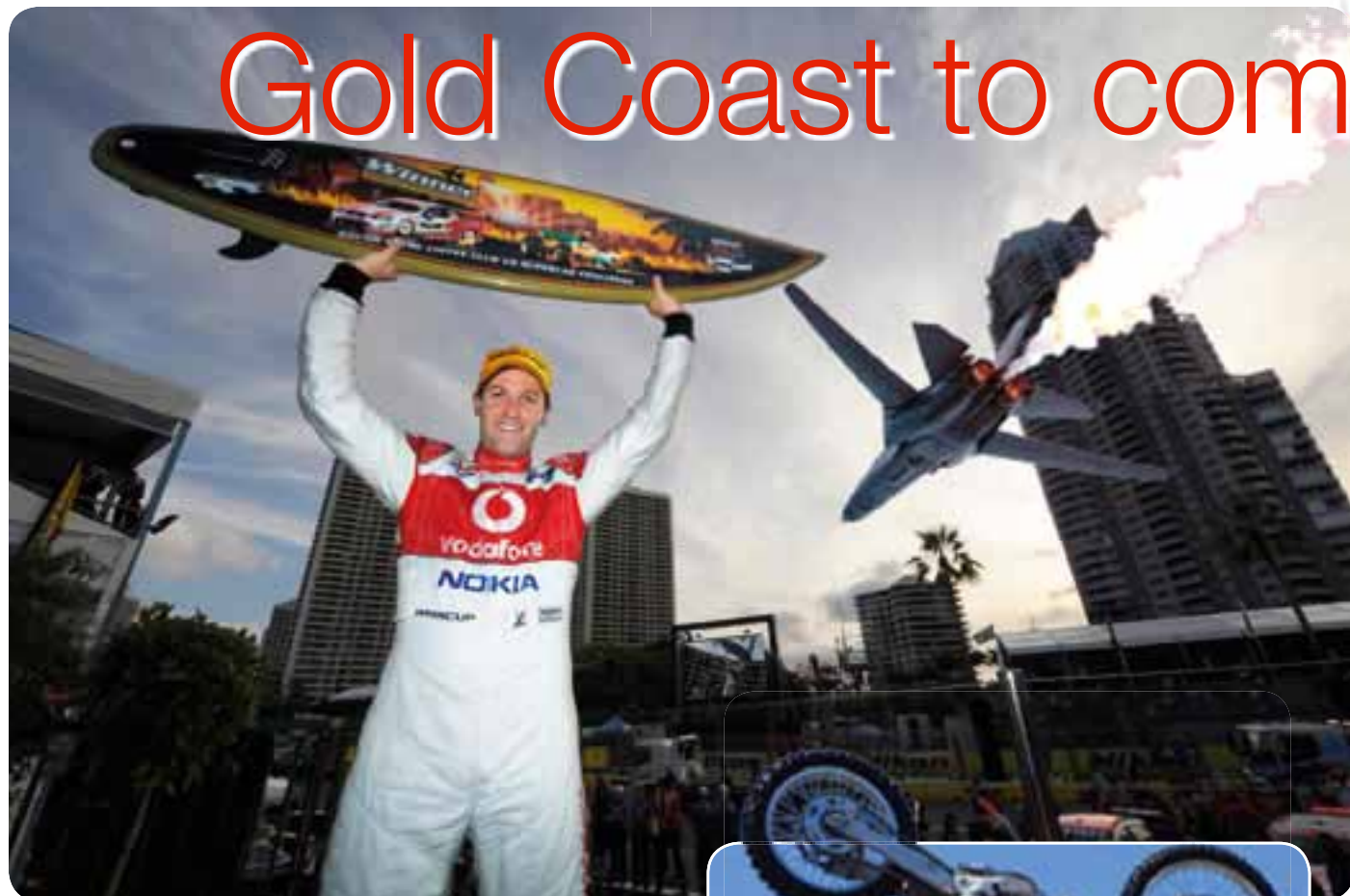
The 2009 Nitro SuperGP on the streets of Queensland's Gold Coast will bring together the stars of the world cup of motorsport with the names of Australia's home grown v8s for four days and nights of high-octane action, October 22-25.

One of Australia's premier annual events, the SuperGP is expected to attract more than 300,000 over the four days and will feature for the first time in 2009 the A1GP World Cup of Motorsport alongside Australia's V8 Supercar Championship Series as co-headline acts.